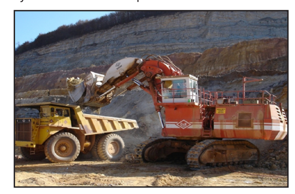
Excavator in operation loading a haul truck.

The challenge was to extend the operating hours between maintenence intervals of the cylinders to improve the availability of the excavator. The mine was looking for a more reliable seal system to prolong the life of the cylinder's metal components.