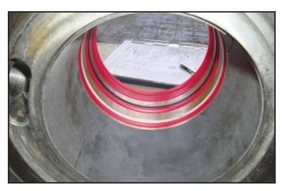
Chesterton rod seal system installed.